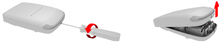
Figure 2: Remove the Cover

If your siren already has batteries installed you need to: