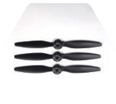
YUNTYH118B 3 pcs of Propeller / Rotor Blade B and other accessories