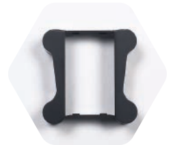
YUNCGO3P104 1 pc of rubber damper protective cover