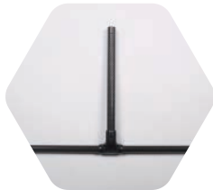
YUNTYH110 Landing gear three-way connector and other accessories