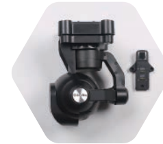
YUNCGO3PEU CGO3+ with black color mounting parts and arms plus any other accessories