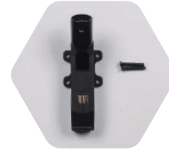
YUNTYH109 1 pc of TYPHOON H landing gear