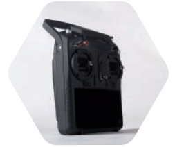
YUNST12HEU 1 pc of ST12 with battery, charger and any other accessories