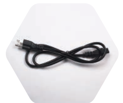
YUNTYHFSP090EU AC to DC adapter power cable with EU plug