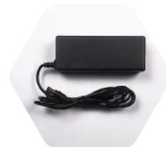
YUNTYHFSP090 AC to DC adapter for TYPHOON H