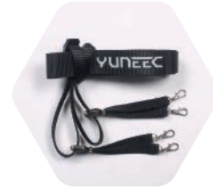
YUNST16101 1 pc of Neck Strap and 1pc of Neck Strap Mount for ST16