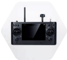
YUNST16EU ST16 with battery, charger and any other accessories