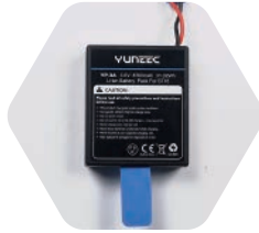
YUNST16100 1 pc of Li-ion battery