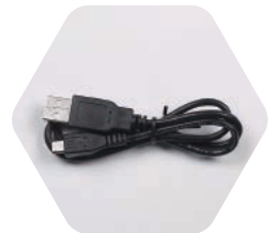
YUNTYH115 USB to Micro USB cable