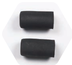
YUNTYH119 2 pcs of black foam damping