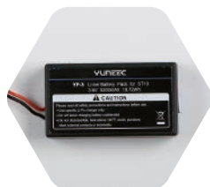
YUNST10100 1 pc of Li-ion battery