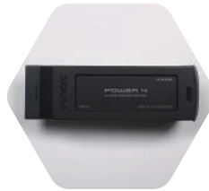
YUNTYH105 TYPHOON H battery