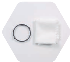
YUNCGO3113 1pc of UV filter 1pc of cleaning cloth