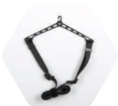
YUNST12103 1 pc of Neck Strap and 1pc of Neck Strap Mount for ST12