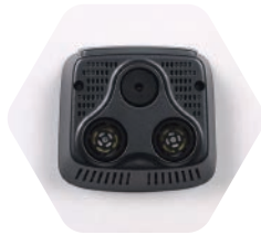
YUNTYHIPS 1 pc of IPS (Indoor Positioning System) for TYPHOON H