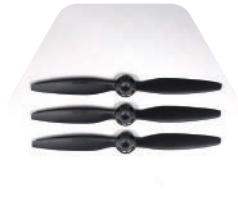
YUNTYH118A 3 pcs of Propeller / Rotor Blade A and other accessories