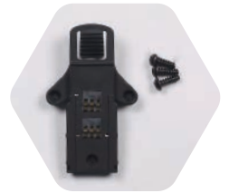
YUNTYH108 Gimbal connection bracket 3 pcs of grub screws Gimbal connection board