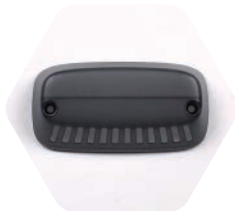
YUNTYH111 TYPHOON H three color lampshade