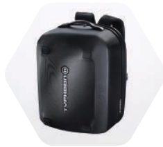
YUNTYHBP Backpack for Typhoon H