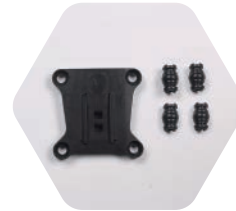
YUNCGO3P101 black color top and bottom mount plus 4pcs of gimbal mount dampers