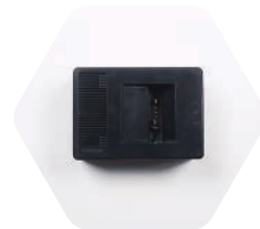
YUNTYHSC4000-4 SC4000-4 charger