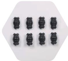
YUNCGO3P102 8 pcs of gimbal mount dampers