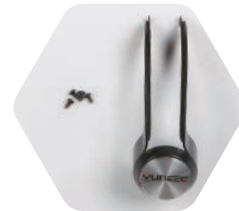
YUNCGO3P103 1 pc of black cover and Yuneec Decal; 6 pcs of screws