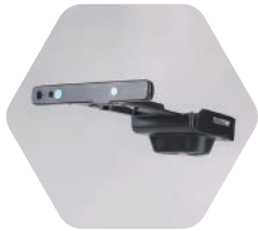
YUNTYHR RealSense for TYPHOON H