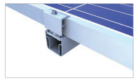
Flush closure end clamp with C-rail