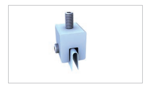
Clamp with saddle for copper standing seam roofs

metal roof. It comprises only three components: the C-rails, the seamed metal and the module clamps. The modules are installed vertically. The module clamps are available in three sizes – and in either blank aluminium or black. Mounting is done comfortably form above. The rails can also be extended with connectors as needed. Our mounting system for seamed metal roofs provides excellent rear ventilation of the modules and – with decent system components and homogenous module fields – attractive aesthetics.