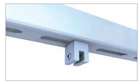
C-rail connection directly on the seam clamp